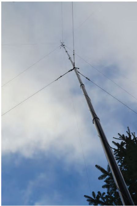
The antenna must be well guyed.

If you have done a good job this should be quite easy, but you can end up with a